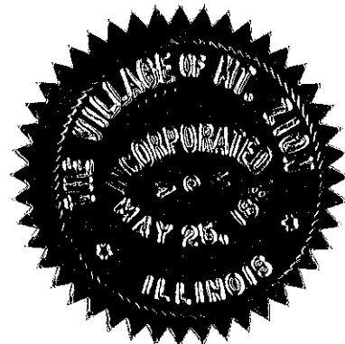
Dawn Reynolds, Village Clerk